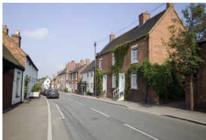
Bagot Street looking west