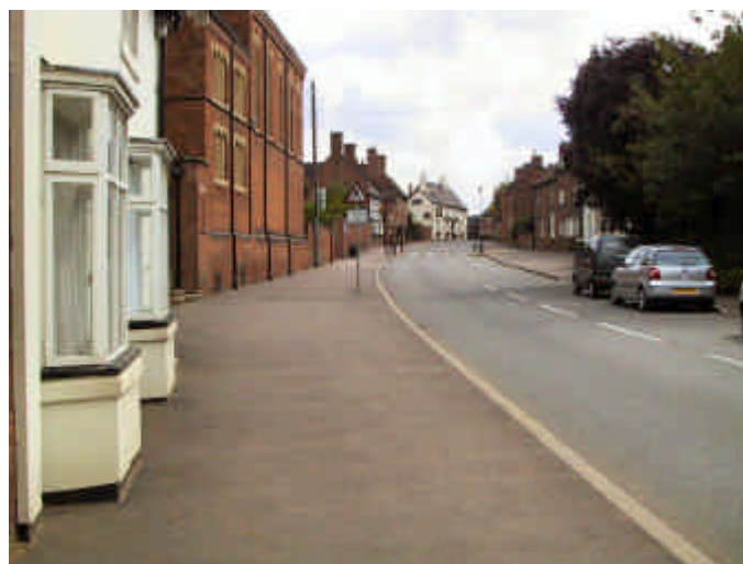
High Street looking east