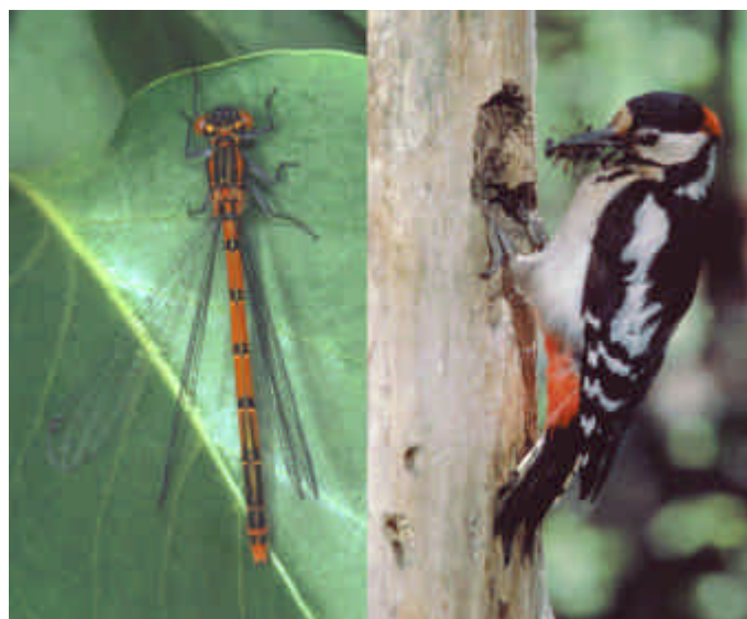
Damselfly and woodpecker