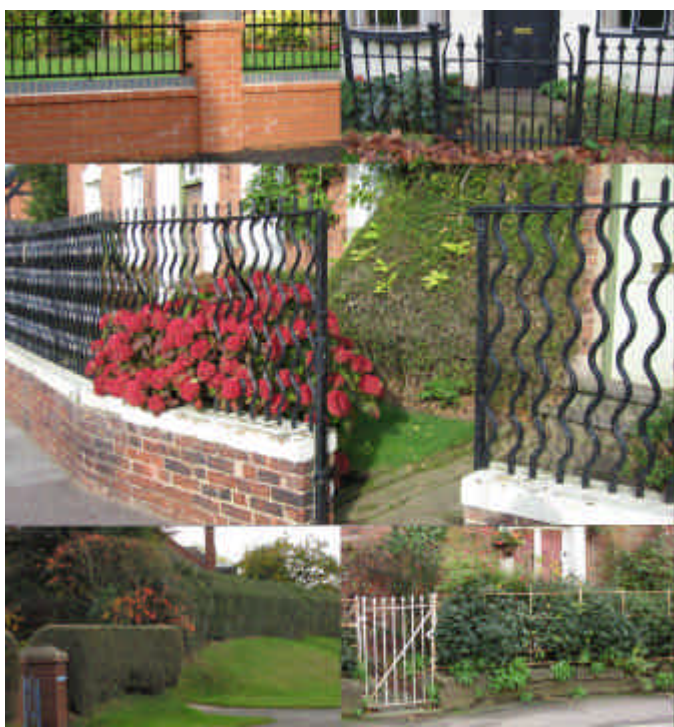
Diversity of boundary styles