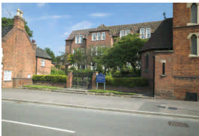
AB School for Girls

3.9 Other major open spaces are centred on the Church; spaces left by closed businesses; spaces maintained by Abbots Bromley School for Girls as sports playing fields and around the playground and Village Hall.