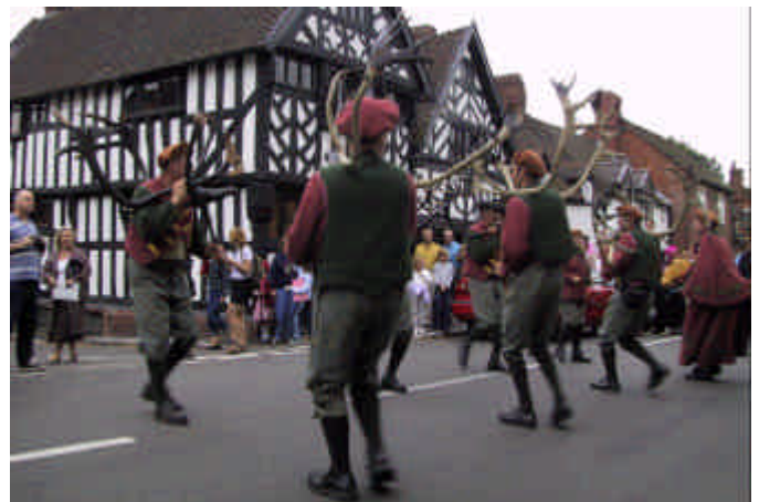
Horn Dancers in Bagot Street

2.23 Several recreational areas provide opportunities for leisure and sport: ▪ A village hall with adjacent bowling green, basketball and tennis courts ▪ A Millennium Green with play equipment for children ▪ Shared use of Abbots Bromley School's playing fields for cricket An under 5s play area is planned to be open by May 2006 although the village still lacks a dedicated sports field.