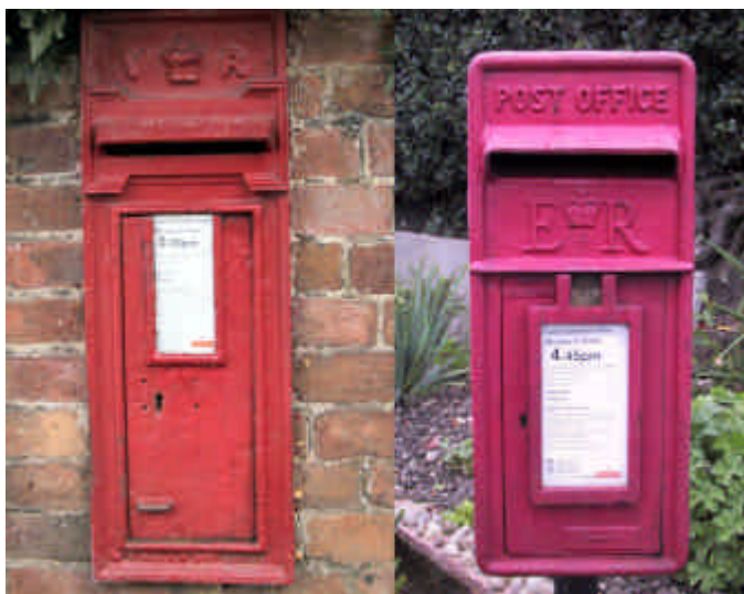
Post boxes from past and present