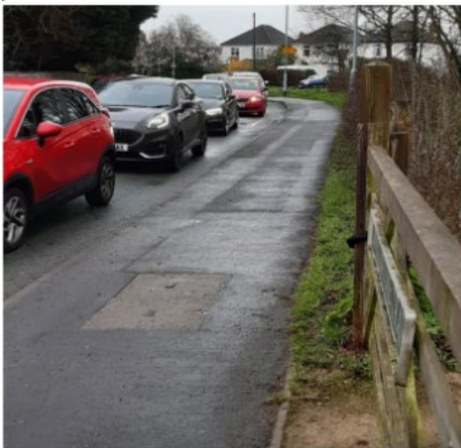
Queue of traffic approaching Bridge Street from Bitham Lane

The Green, DE13 0EQ, a one-way street, is to the left of this photo, this road is used as a cut through to avoid staggered crossroads near to St Marys' Church in Stretton and so traffic adjoining Bridge Street is far higher than expected and includes heavy goods vehicles on a daily basis. There are also daily instances of drivers entering via the exit / no entry junction viewable in this photo.